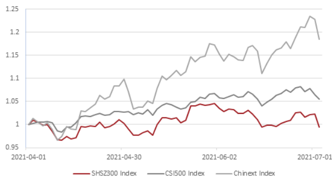
Growth Tech Outperformance Q2

China's equity market saw growth names outperform in 21Q2 again, thanks to a tamed US treasury yield. Semiconductor manufacturers and electric vehicle supply chain companies are the outstanding performers. The healthcare sector remains popular and is one of the top picks among institutional investors. Cyclical names also managed to provide a decent return. With the continuous improvement of the US labour market, tapering the US stimulus programme seems inevitable and so does the normalization of Fed monetary policy. Growth names will probably see pressure on their valuations and only those who can deliver remarkable growth could outperform. We recommend investors to remain cautious, especially regarding names with a stretched valuation and a less promising growth outlook.